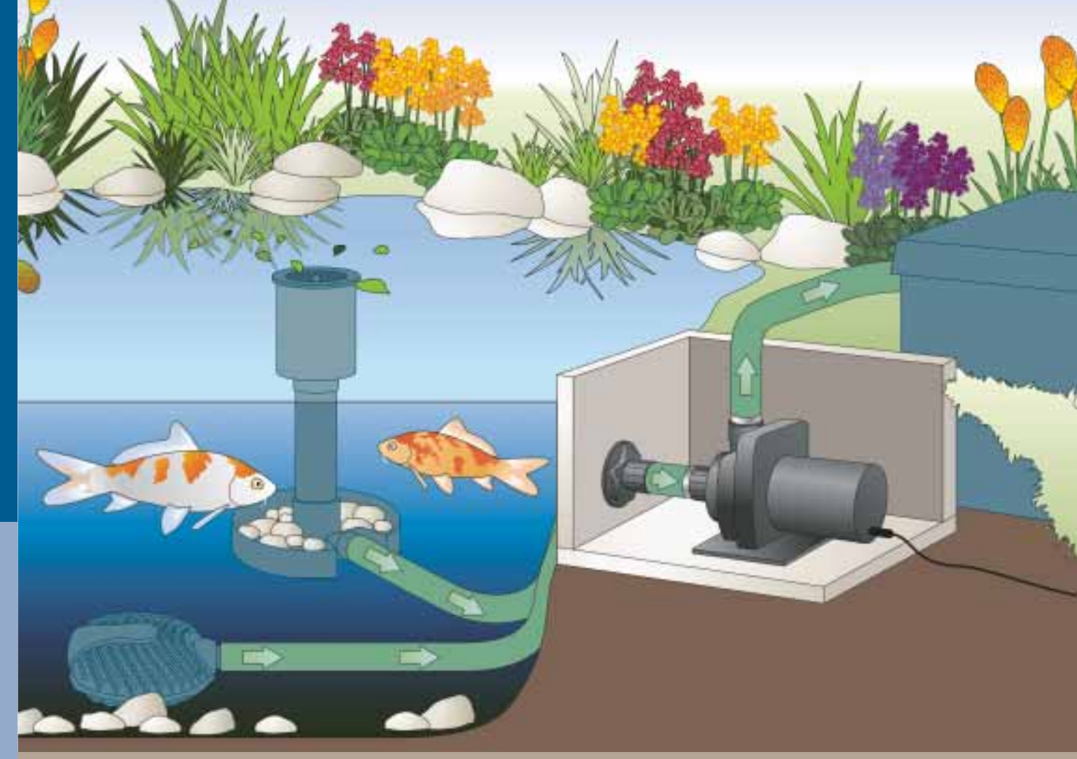
Schematic representation: Dry installation for Filter and Watercourse pump Aquamax Dry 14000 (PRO) with concurrent operation of skimmer and satellite filter